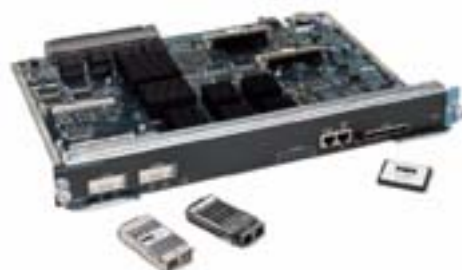
Figure 1 Cisco Catalyst 4500 Series Supervisor Engine IV

The Cisco Catalyst 4500 Series Supervisor Engine IV delivers next-generation switching technology with proven Cisco IOS® Software to power scalable, intelligent multilayer switching solutions for converged data, voice, and video networks. Optimized for the enterprise wiring closet, branch office backbones, or Layer 3 distribution points, the Cisco Catalyst 4500 Series Supervisor Engine IV provides the performance and scalability to handle the network applications of today and the future. Compatible with the widely deployed Cisco Catalyst 4006 chassis and the Cisco Catalyst 4500 Series chassis and line cards, the Cisco Catalyst 4500 Series Supervisor Engine IV helps to ensure an extended window of deployment to further strengthen the scalability of the modular Cisco Catalyst 4500 Series.