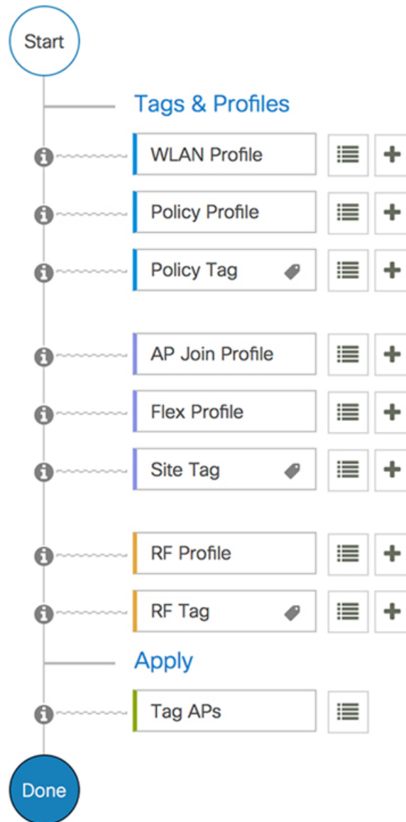
Figure 1: Configuration Workflow