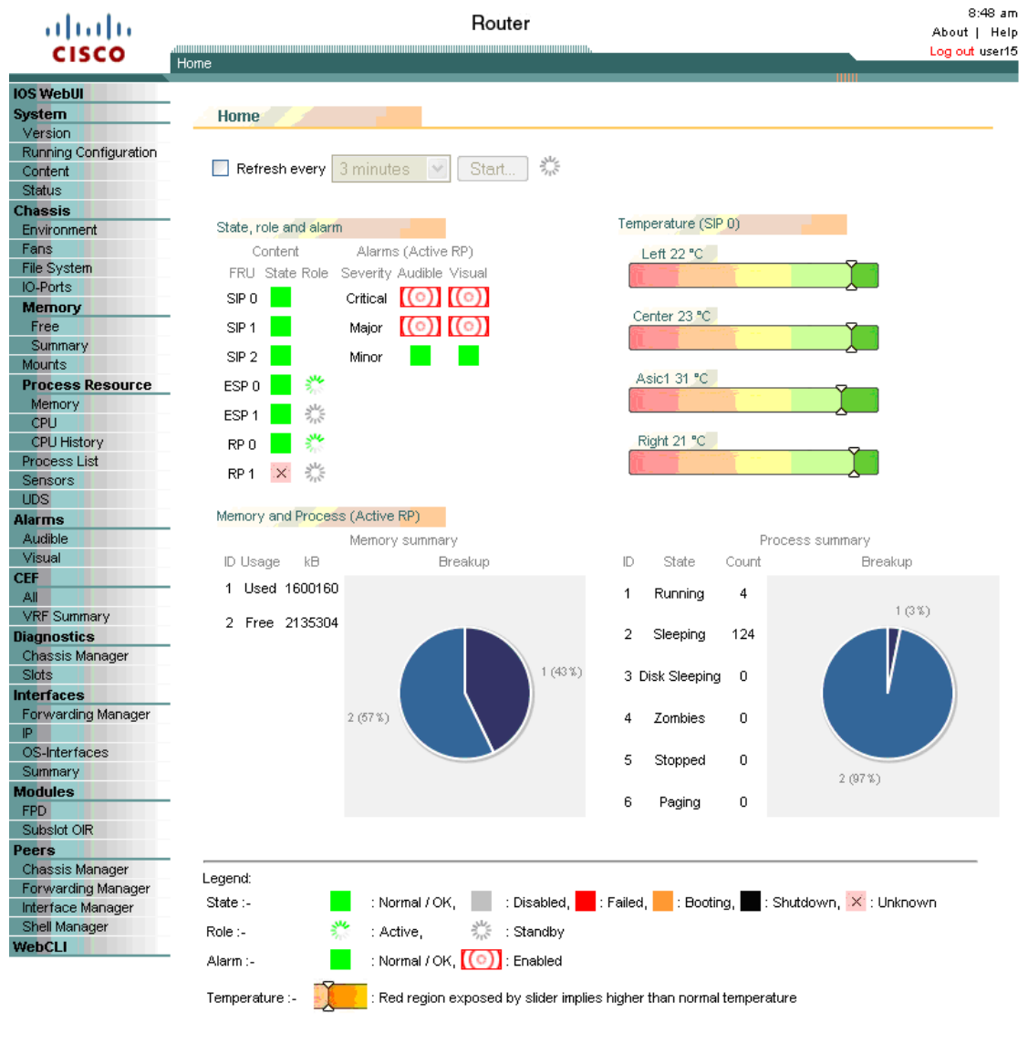
Figure 10-2 Graphics-Based Web User Interface Home Page