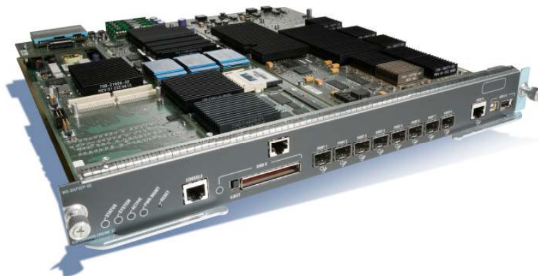
Figure 2. Supervisor Engine 32 PISA with 2-Port 10 Gigabit Ethernet and PFC3B