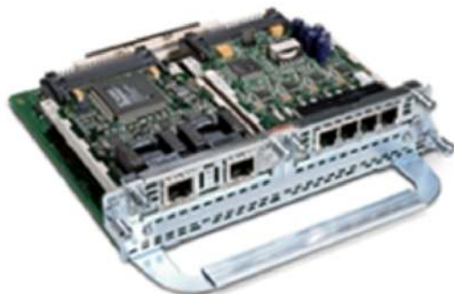
Figure 1. NM-HD-2VE with One VWIC2-2MFT and One VIC3-4FXS/DID

The Cisco IP Communications voice/fax network modules for the Cisco 2800, 2900, 3800, and 3900 Series unified communications routers enable packet voice technologies including VoIP (H.323, Media Gateway Control Protocol [MGCP], and Session Initiation Protocol [SIP]). Cisco Unified Communications solutions provide the means for integrating voice and data within a single network, allowing users to take advantage of services such as IP telephony, integrated services, and toll-bypass while providing an opportunity to improve productivity. By operating on Cisco IOS Software, these solutions incorporate advanced quality-of-service (QoS) features, intelligent network queuing, and standards-based encapsulation, providing efficient direct transport of both voice and fax over IP networks. Cisco IOS Software solutions enable time-sensitive voice traffic to be moved across even low-bandwidth WAN connections with the priority and quality that voice and fax demand. Transporting voice over IP networks continues to provide transport flexibility because IP can be routed across a multitude of WAN technologies (leased lines, Frame Relay, and ATM) along with providing direct connectivity to the desktop.