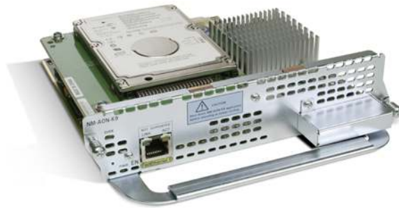
Figure 1. Cisco 2600, 2800, 3600, 3700, and 3800 Series Content Engine Network Module

The Cisco® 2600, 2800, 3600, 3700, and 3800 series Content Engine Network Modules (NM) offer the industry's first and only router-integrated application platform for accelerating data center-based applications, enabling consolidation of infrastructure into the data center.