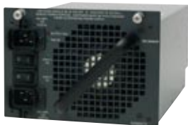
Figure 1. 4200W AC Power Supply

1000WAC: Data-only AC power supply designed for Cisco Catalyst 4503, 4506, and 4507R chassis