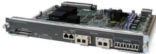
Cisco Catalyst 4500 Series Supervisor Engine II-Plus-10GE

The Supervisor Engine II-Plus-10GE is ideal for enterprises and medium-sized businesses that require secure, high-performance connectivity with maximum uptime in the LAN access layer. It is also well suited for DSLAM aggregation in Metro Ethernet environments. All four Gigabit and both 10-Gigabit ports are active and may be used concurrently.