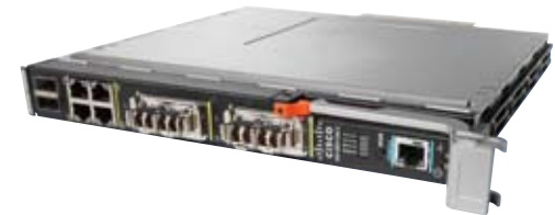
Figure 2. Cisco Catalyst Blade Switch 3120