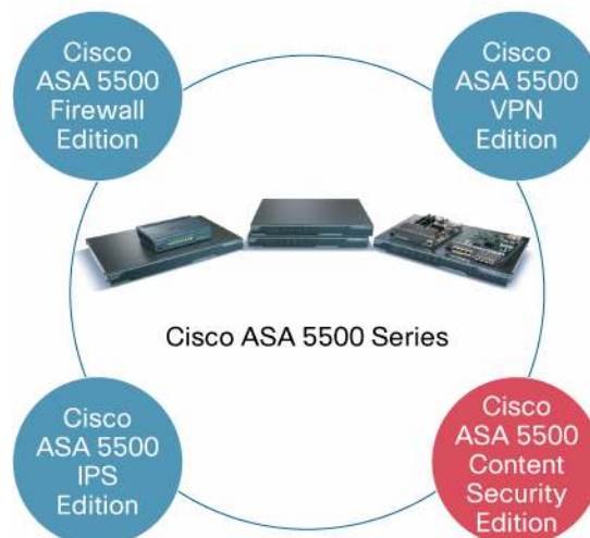
Figure 2. Complementary Solutions

Cisco Systems® and its partners offer world-class service and support tailored for your business. Cisco has adopted a lifecycle approach to services that addresses the necessary set of requirements for deploying and operating Cisco ASA 5500 Series security appliances. This approach can help you improve your network's business value and return on investment. For more information on Cisco security services, visit http://www.cisco.com/en/US/products/svcs/ps2961/ps2952/serv_group_home.html .