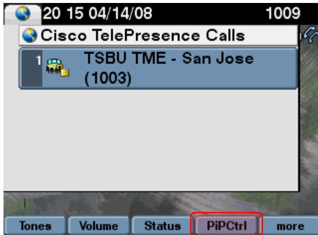
Figure 3: Cisco 7975 IP Phone Interface during active call