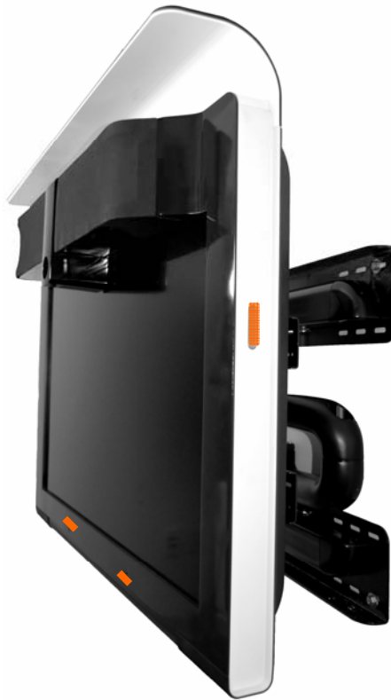
Figure 2: Cisco TelePresence 500 System Positioning LED's

Overview: Proper placement of the Cisco TelePresence 500 System unit is crucial to the experience. The unit must be placed in a position that allows for the participant to be seen in the proper position and size to the remote participants. Once you have validated that the unit is the proper distance from the participant, you must also validate that the user is properly centered in the camera's view and at the right height while seated. The Cisco TelePresence 500 System has some guiding LED's that help ensure that the user is in the right position. If the user is able to see any of these positioning LED's while seated, then they are in the wrong position, and the participant should adjust their seat such that they can no longer see the LED's.