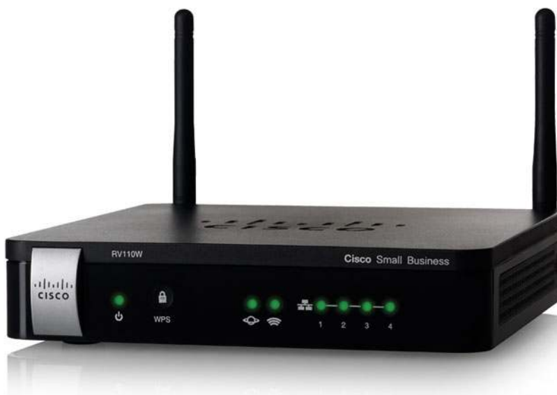
Figure 1. Cisco RV110W Wireless-N VPN Firewall

The Cisco® RV110W Wireless-N VPN Firewall provides simple, affordable, highly secure, business-class connectivity to the Internet for small offices/home offices and remote workers.