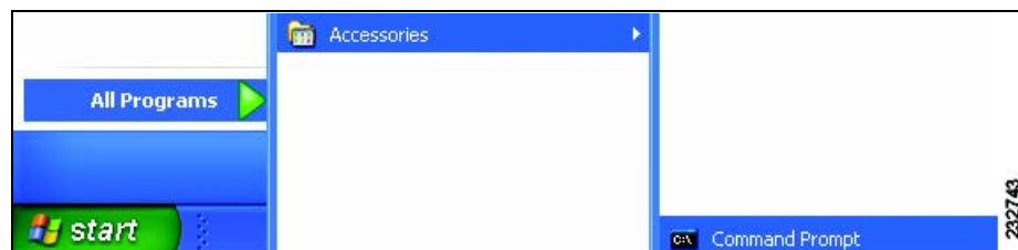
Figure 2 Start > All Programs > Accessories > Command Prompt