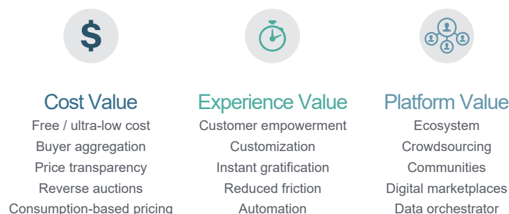
(Figure 1) Three Forms of Value and Their Business Models