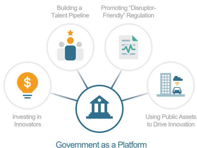
(Figure 3) Government as a Platform: 4 Key Focus Areas