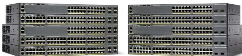
Figure 1. A Cisco Catalyst 2960-X Series Switch Family

Cisco® Catalyst® 2960-X Series Switches are fixed-configuration, stackable Gigabit Ethernet switches that provide enterprise-class access for campus and branch applications (Figure 1). Designed for operational simplicity to lower total cost of ownership, they enable scalable, secure and energy-efficient business operations with intelligent services and a range of advanced Cisco IOS® Software features.