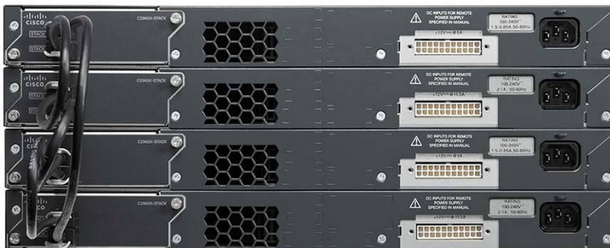
Figure 2. Cisco FlexStack-Plus Switch Stack