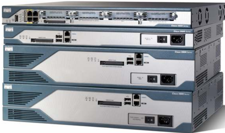
Figure 1 Cisco 2800 Series

Cisco Systems ® , Inc. is redefining best-in-class enterprise and small- to- midsize business routing with a new line of integrated services routers that are optimized for the secure, wire-speed delivery of concurrent data, voice, and video services. Founded on 20 years of leadership and innovation, the Cisco ® 2800 Series of integrated services routers (refer to Figure 1) intelligently embed data, security, and voice services into a single, resilient system for fast, scalable delivery of mission-critical business applications. The unique integrated systems architecture of the Cisco 2800 Series delivers maximum business agility and investment protection.