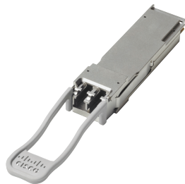
Cisco BiDi Dual-Rate Transceiver