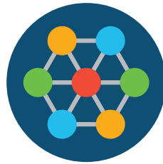
Complete hyperconverged solution