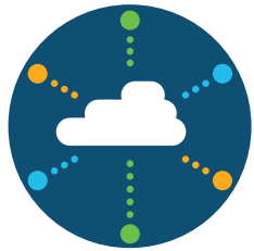
Designed for today's computing landscape