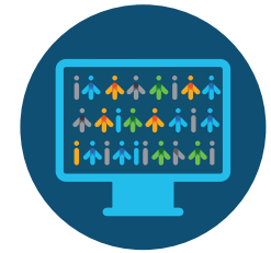
Consistent management across all sites