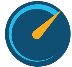
Delivers performance for latency-sensitive applications