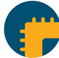
All-NVMe storage architecture