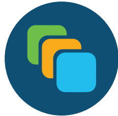
Ready for your mission-critical applications