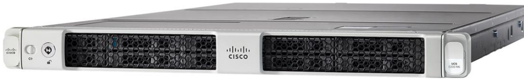
Figure 1. IEC6400 Edge Computing Appliance

The Cisco IEC6400 Edge Compute Appliance combines the best from Cisco URWB technology with Cisco's leading computing platforms. Leveraging the capabilities of the Cisco UCS® C220 M6 Rack Server, this appliance allows you to extend the benefits of Cisco URWB to large-scale, high-capacity-demanding wireless networks. It works as an aggregation point for all the MPLS-over-the-wireless communications in networks with up to hundreds of IW devices requiring multi-Gbps aggregated throughput.