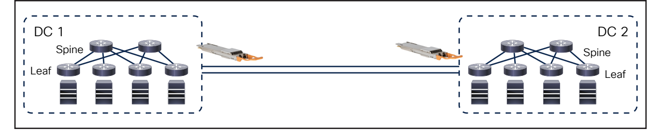
Figure 1. DCI transport from data center switches

The simplest deployment model is point-to-point , which connects two locations directly from switch ports in the data center, transporting a single 400G wavelength. Typically, this deployment model spans up to 40 km reaches without the need for amplification and can be extended to longer reaches with amplification (Figure 1).