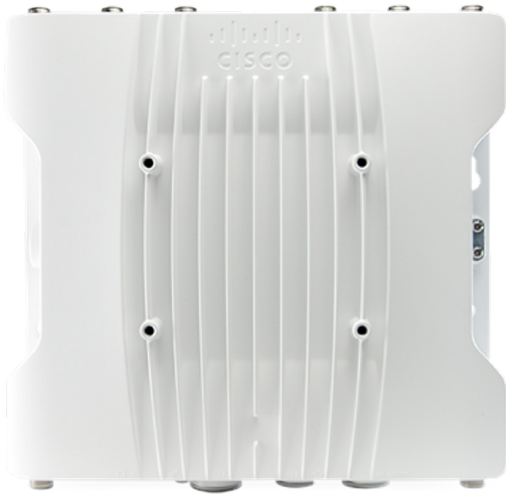
Figure 1. Cisco Catalyst IW9167E-HZ Heavy Duty Access Point

The Cisco Catalyst™ IW9167E Series comes to hazardous locations with the IW9167E-HZ model.