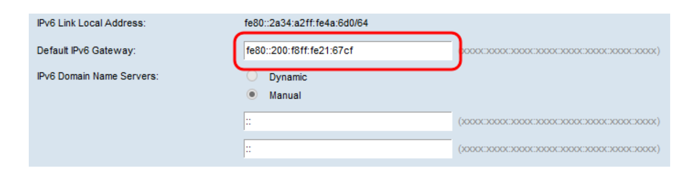
Step 8. If you selected DHCPv6 in Step 2, choose the radio button from the IPv6 Domain Name Servers field for how you would like DNS servers to be allocated.

Step 7. If you selected Static IPv6 in Step 2, enter an IPv6 address in the Default IPv6 Gateway field to use as the default gateway address, otherwise skip to Step 8.