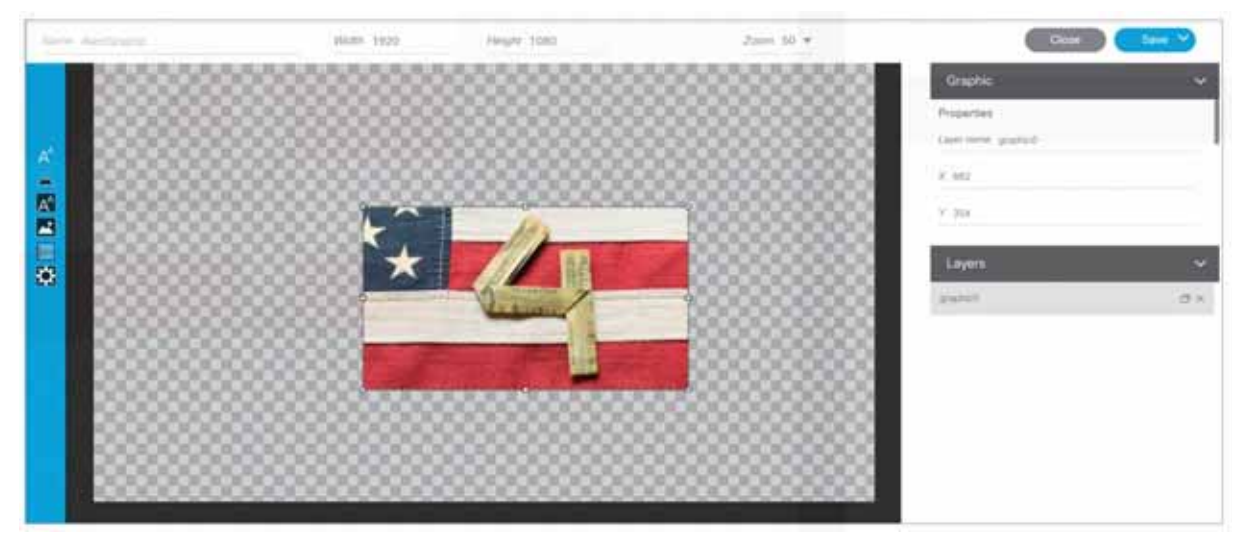
Figure 5 Widget Designer

As content assets, widgets are stored in the Cisco Vision Dynamic Signage Director Library once published from the Widgets tool. Use the standard template, playlist, and script configuration elements to deploy the widget.