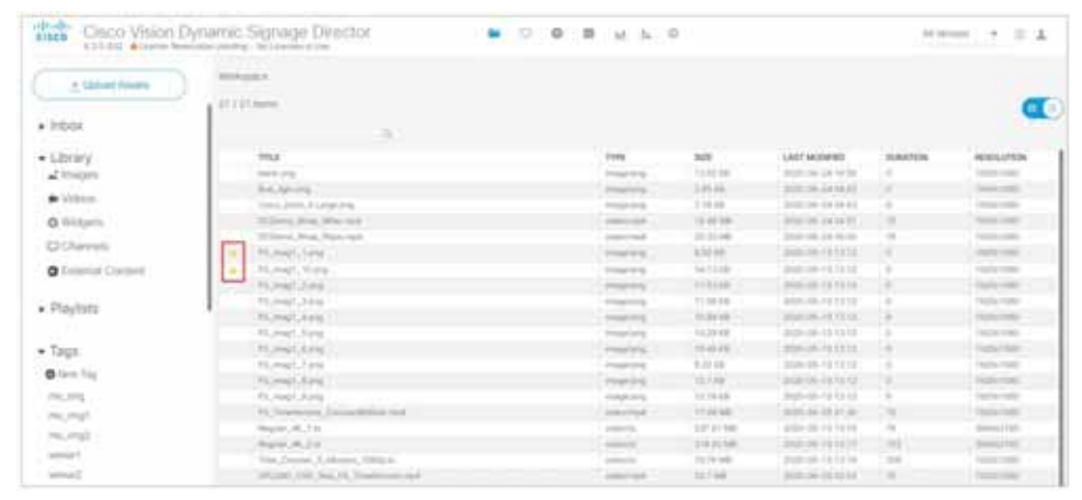
Figure 2 Caution Symbol Indicating this Content will Not Render as Desired

If your external content is unlikely to render to the DMP, you get a caution symbol until you clear it (Figure 2 on page 14).