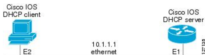
Figure 2: Topology Showing DHCP Client with GigabitEthernet Interface

The figure below shows a simple network diagram of a DHCP client on an Ethernet LAN.