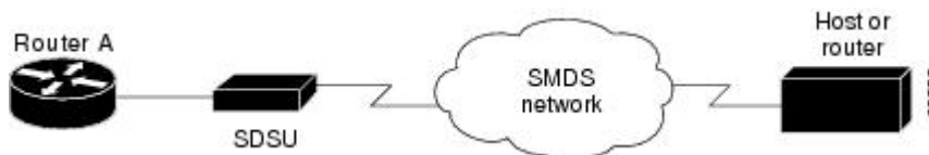
Figure 1: Typical SMDS Configuration

The figure below illustrates the connections among the components.