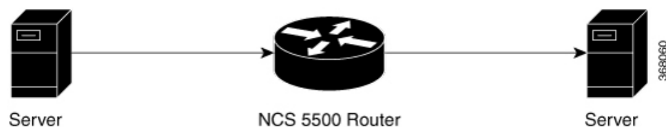
Figure 2: Topology for ERSPAN Egress Rate Limit