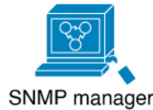
Figure 3: Trap Not Received by the SNMP Manager

In this illustration, the agent sends a trap to the manager, but the trap does not reach the manager. Because the agent has no way of knowing that the trap did not reach its destination, the trap is not sent again. The