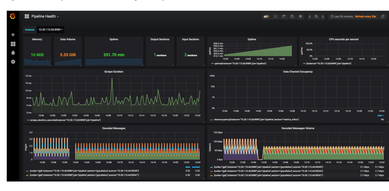
Figure 2: Visual Analysis of Network Health using Telemetry Data

Step 2 Use Grafana to create a dashboard and visualize the streamed data.