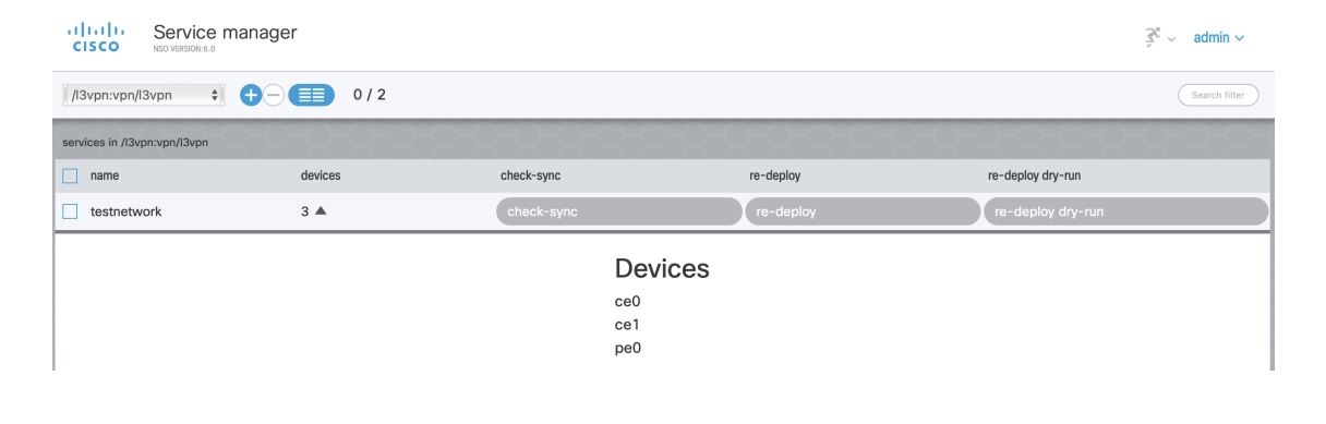
Figure 4: L3VPN in NSO