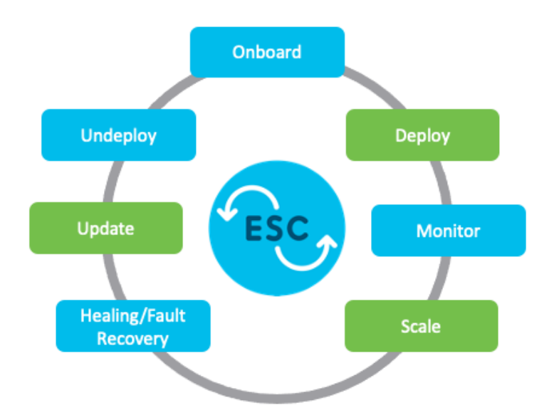
Figure 2: ESC's VNF Lifecycle

• Onboarding —In ESC, you can onboard any new VNF type as long as it meets the prerequisites for supporting it on OpenStack and VMware vCenter. For example on Openstack, Cisco ESC supports raw image, qcow2 and vmdk disk formats. ESC also supports config drive for the VNF bootstrap mechanism. You can define the XML template for the new VNF type to onboard the VNF with ESC.