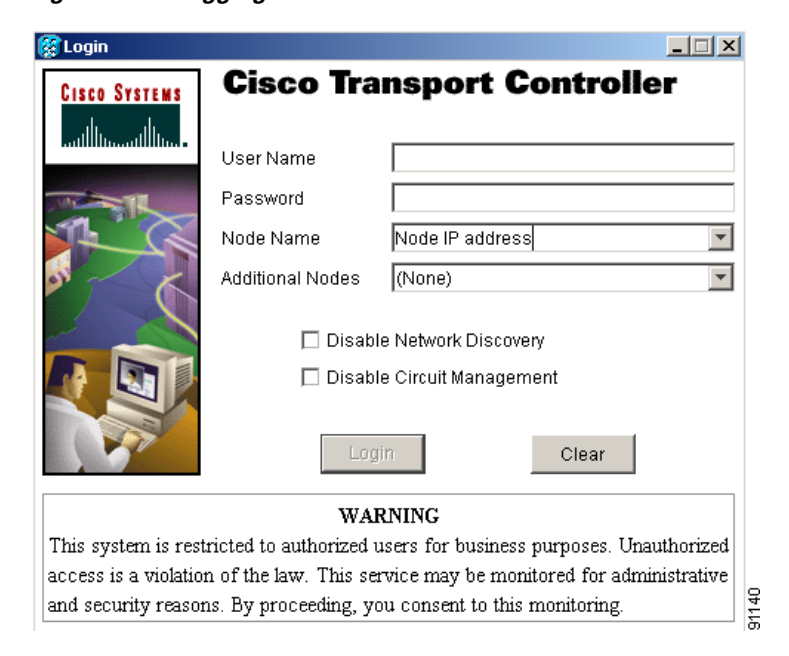
Figure 3-2 Logging into CTC

Step 3 In the Login dialog box, type a user name and password (both are case sensitive). For initial setup, type the user name "CISCO15."