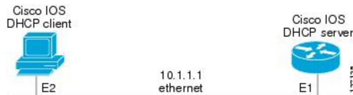
Figure 2: Topology Showing DHCP Client with GigabitEthernet Interface

On the DHCP server, the configuration is as follows: