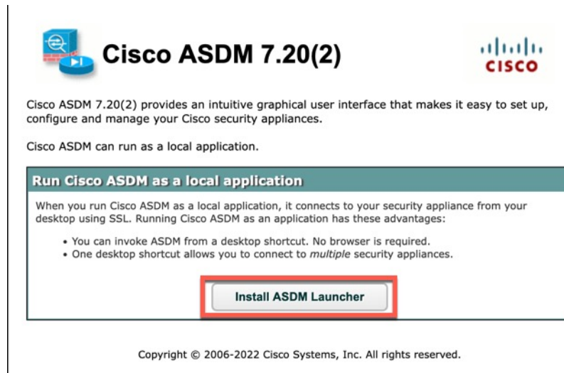
Figure 1: Install ASDM Launcher