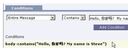
Figure 10: Multiple Character Sets in a Content Filter

You can mix and match multiple character sets within a single content filter. Refer to your web browser’s documentation for help displaying and entering text in multiple character encodings. Most browsers can render multiple character sets simultaneously.