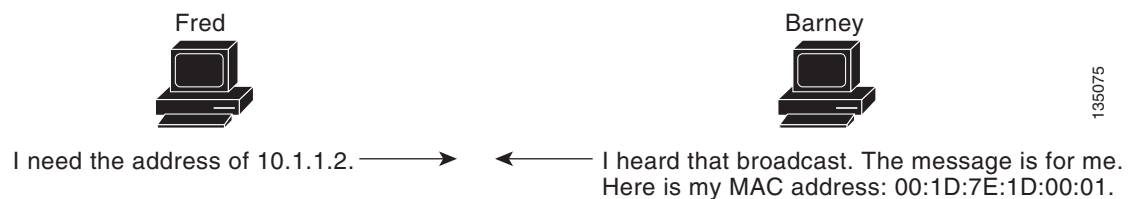
Figure 2-1 ARP Process

When the destination switch lies on a remote network which is beyond another switch, the process is the same except that the switch that sends the data sends an ARP request for the MAC address of the default gateway. After the address is resolved and the default gateway receives the packet, the default gateway broadcasts the destination IP address over the networks connected to it. The switch on the destination switch network uses ARP to obtain the MAC address of the destination switch and delivers the packet. ARP is enabled by default.