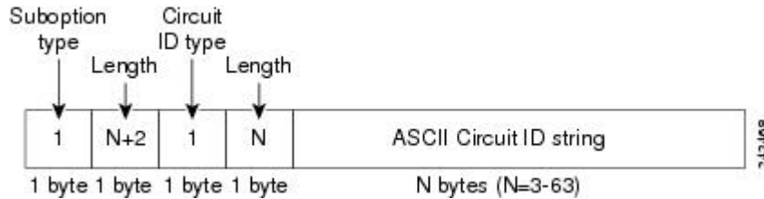
Figure 1: Suboption Packet Formats, Circuit ID Specified

The figure below shows the packet format used when DHCP snooping is globally enabled and the ip dhcp snooping information option global configuration command is entered with the Remote ID suboption.