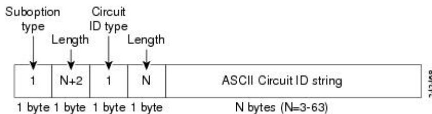
Figure 1: Suboption Packet Formats, Circuit ID Specified

The figure below shows the packet format used when DHCP snooping is globally enabled and the ip dhcp snooping information option global configuration command is entered with the Remote ID suboption.