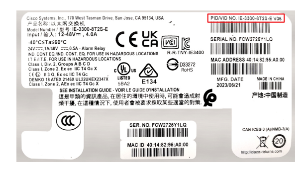
Figure 1: IE3300 Switch Label

You also can see the Version ID by entering the show version command and examining the output, as shown in the following example: