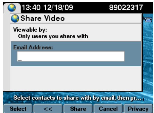
Figure 8-1 Share Video Screen