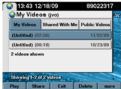
Figure 8-3 CTRS and Public Video Sharing

Allows you to view the videos that are on your Cisco TelePresence Recording Server (CTRS) account or the public videos that you have saved.