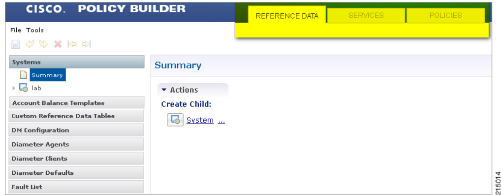
Figure 1: Cisco Policy Guilder GUI

aspects of the PB GUI as laid out in three tabs on the upper right of the interface: Reference Data, Services and Policies.