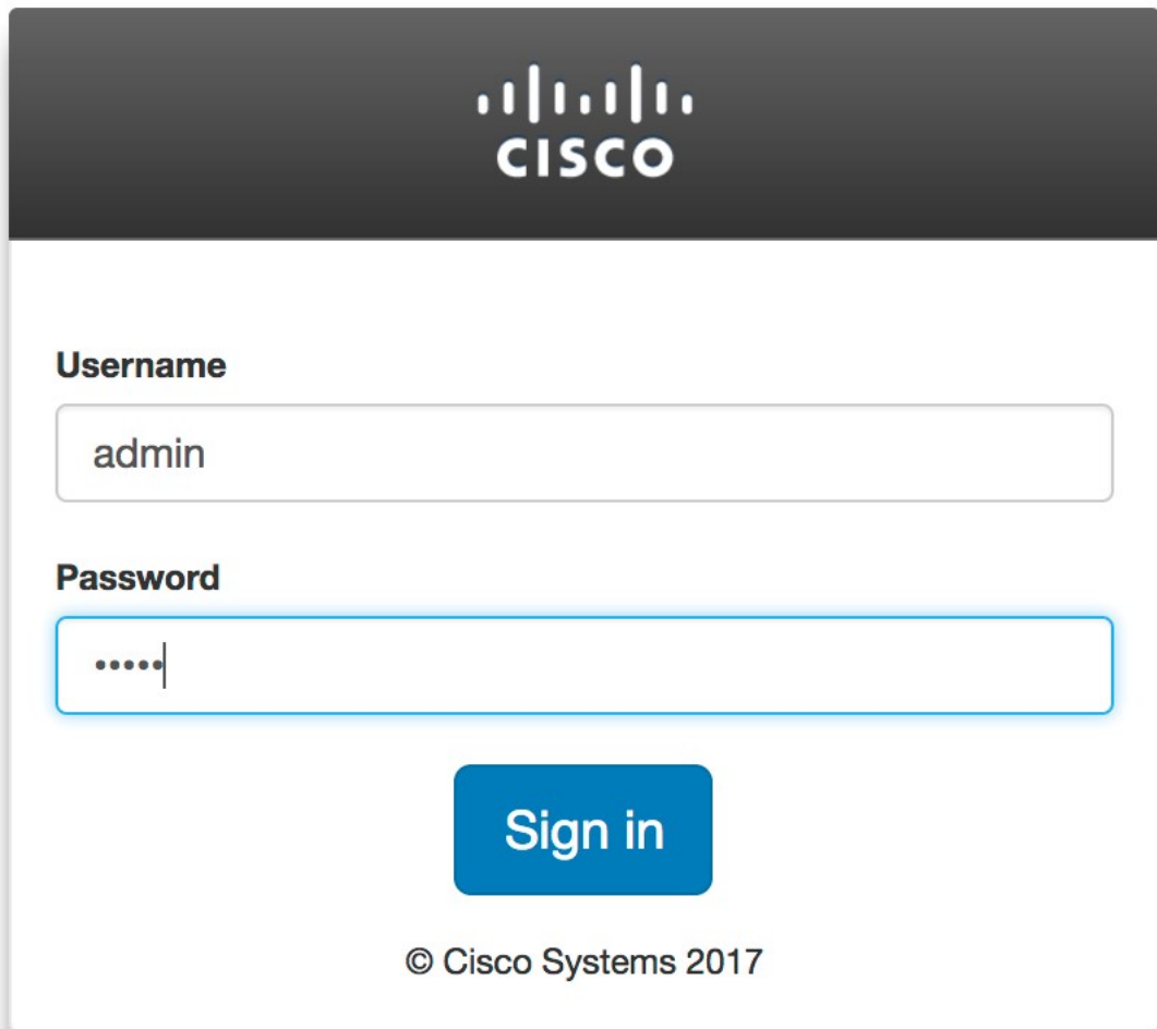
Figure 1: CPS DRA Login

Step 4 In the Management screen, click the Login link to display the in-browser terminal window.