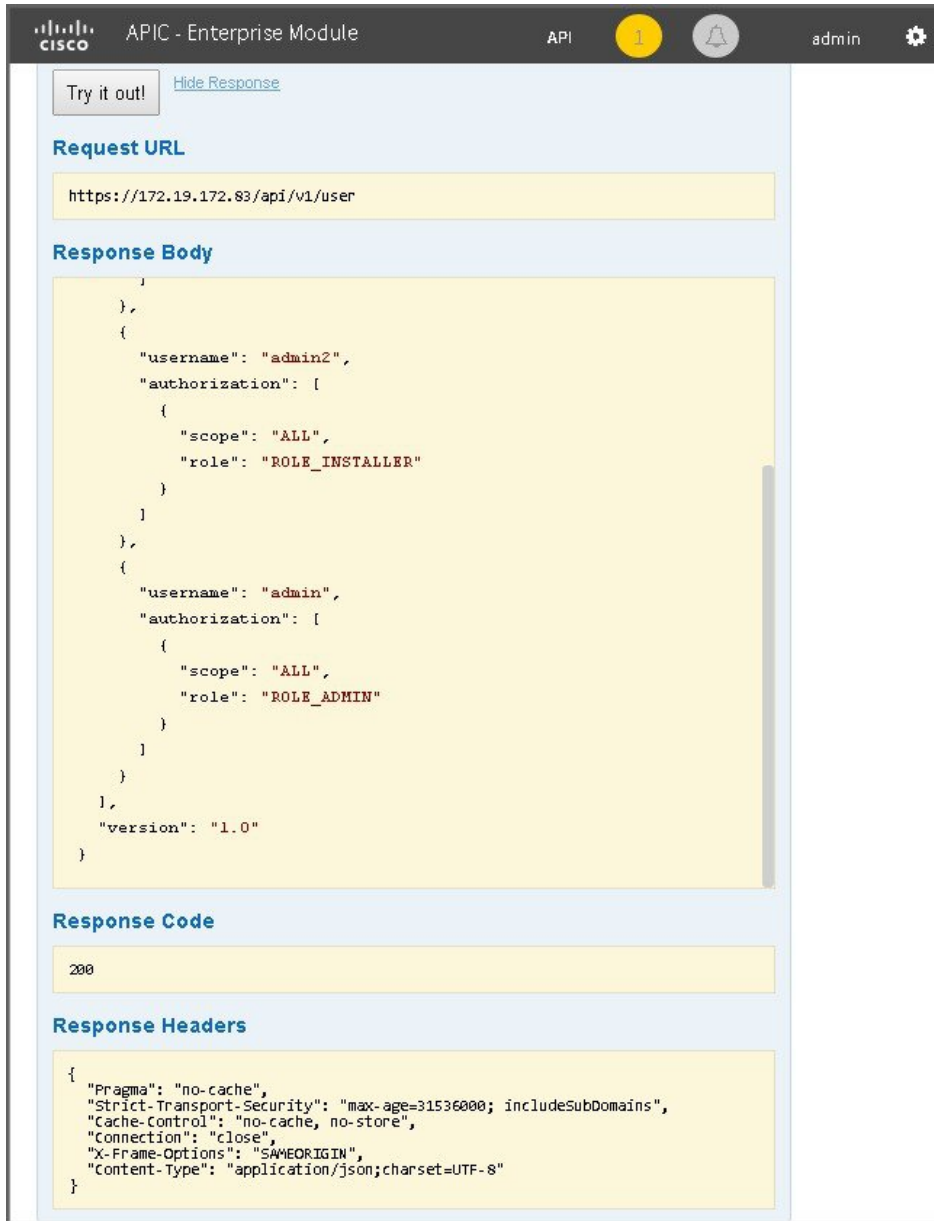
Figure 4: Output the getUsers API