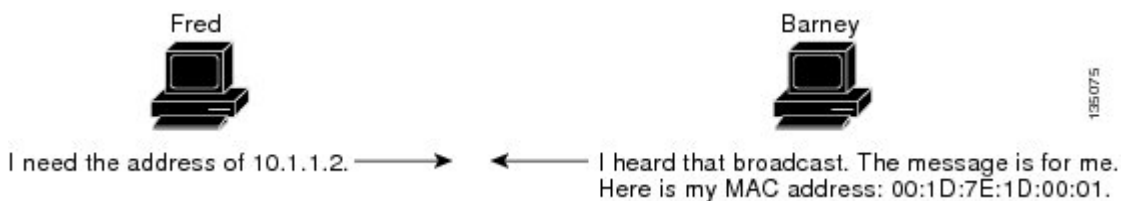
Figure 1: ARP Process

When the destination switch lies on a remote network which is beyond another router, the process is the same except that the switch that sends the data sends an ARP request for the MAC address of the default gateway. After the address is resolved and the default gateway receives the data packet, the default gateway broadcasts the destination IP address over the networks connected to it. The switch on the destination switch network uses ARP to obtain the MAC address of the destination switch and delivers the packet. ARP is enabled by default.