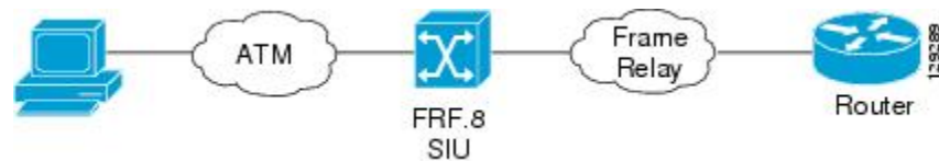
Figure 1: Frame Relay-to-ATM Interworking

You can configure ATM PVCs for IETF-compliant LLC encapsulated PPP over ATM on either point-to-point or multipoint subinterfaces. Multiple PVCs on multipoint subinterfaces significantly increase the maximum number of PPP-over-ATM sessions running on a router.