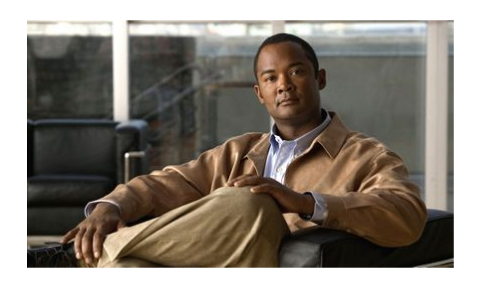
High Availability Configuration Guide, Cisco IOS Release 12.2SR

Americas Headquarters Cisco Systems, Inc. 170 West Tasman Drive San Jose, CA 95134-1706 USA http://www.cisco.com