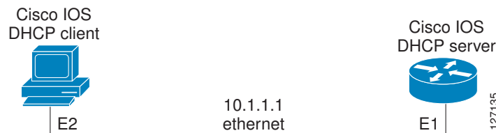
Figure 2 Topology Showing DHCP Client with GigabitEthernet Interface

The figure below shows a simple network diagram of a DHCP client on an Ethernet LAN.