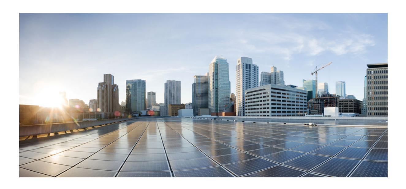
Public Key Infrastructure Configuration Guide Cisco IOS Release 12.2SX