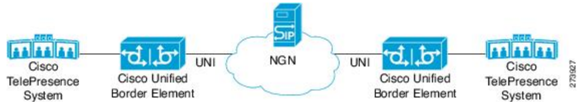
Figure 1: Cisco NGN with Cisco Unified Border Element providing UNI interface

The figure below shows the Cisco Unified Border Element providing the UNI interface for the NGN.