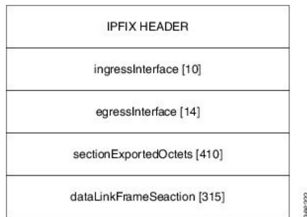
Figure 3: IPFIX 315 Export Packet Format

A special cache type called Immediate Aging is used while exporting the packets. Immediate Aging ensures that the flows are exported as soon as they are added to the cache. Use the command cache immediate in flow monitor map configuration to enable Immediate Aging cache type.